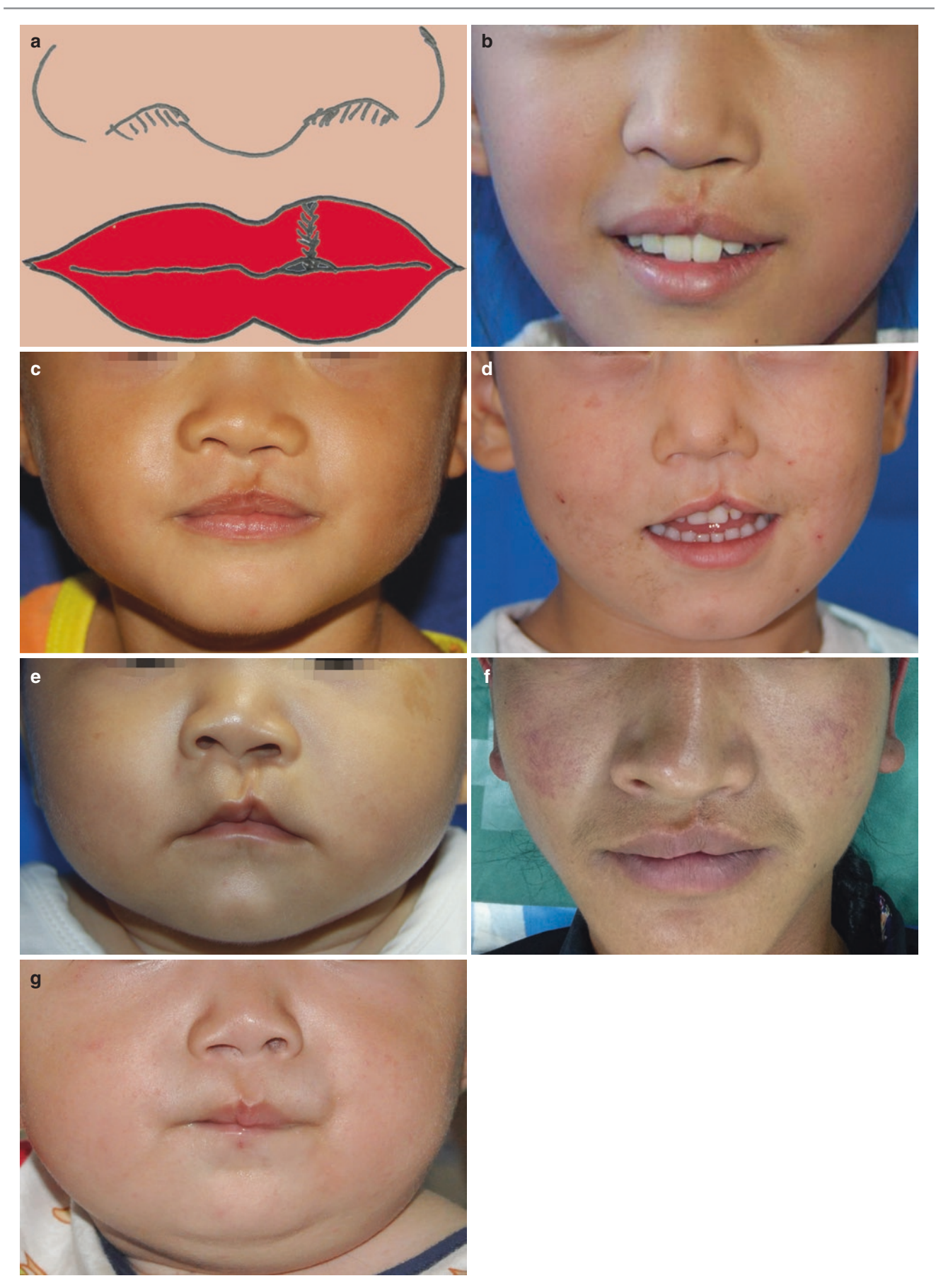
Fig. 1.1 Minimal cleft lip (first-degree cleft lip). (a) split of red lip; (b) (c) split of red lip with orbicularis oris disruption; D–G crack and gap of red lip