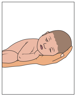
Newborn: First month of life (first 28 days of life)