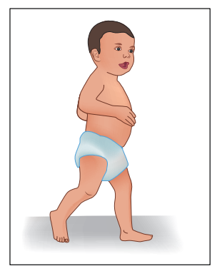
Toddler: 1 to 3 years