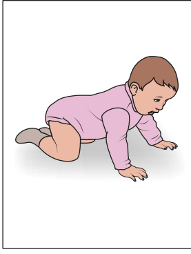
Infant: 1 to 12 months