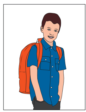
Schoolchild: 6 to 12 years (some consider it from 5 to 18 years)