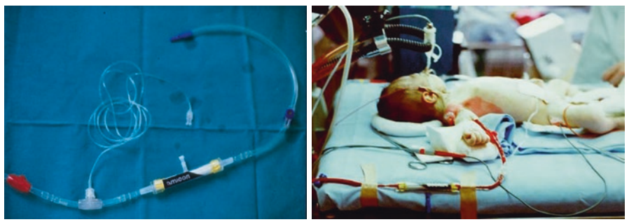
The First Patient treated with CAVH (Vicenza-Italy, 1980)

I could not imagine a better organization of the table of contents that are so complete and exhaustive. I am gratified to see that the concept of critical care nephrology has crossed the line and barrier between adult and pediatric medicine. The authors of this book should be congratulated for the difficult but successful work they have done for the benefit of the scientific community and the patients and families we serve. Critical Care Nephrology in Children, the time has come!