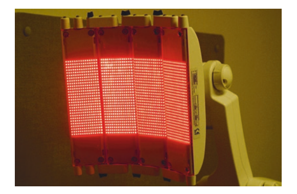
Fig. 1.1 A red LED (OmniLux, Phototherapeutics, Inc.)

Light emitting diodes (LEDs) are becoming commonplace in dermatology (Fig. 1.1). Primarily used as a PDT light source, they are also used in biostimulation. LEDs are similar to semiconductor (aka diode) lasers in that they use electrical current placed between two types of semiconductors. However, they lack an amplification process (no mirrors). LEDs do not produce coherent beams but can produce monochromatic light. Semiconductor (diode) lasers contain an LED as the active gain medium. A current passes through a sandwich of two layers consisting of compounds (called p type and n type). Below threshold, there