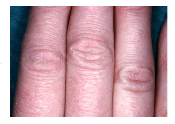
Fig. 1.3 The skin of the dorsum of the fingers covering the interdigital proximal joints. When the skin is being extended, this area is like a volcanic crater (i.e., a circular depression surrounded by skin pads) (see text)

• The eponychium is a fragile area at the extremity of the fingers. Its anatomical features are described in Chap. 4.