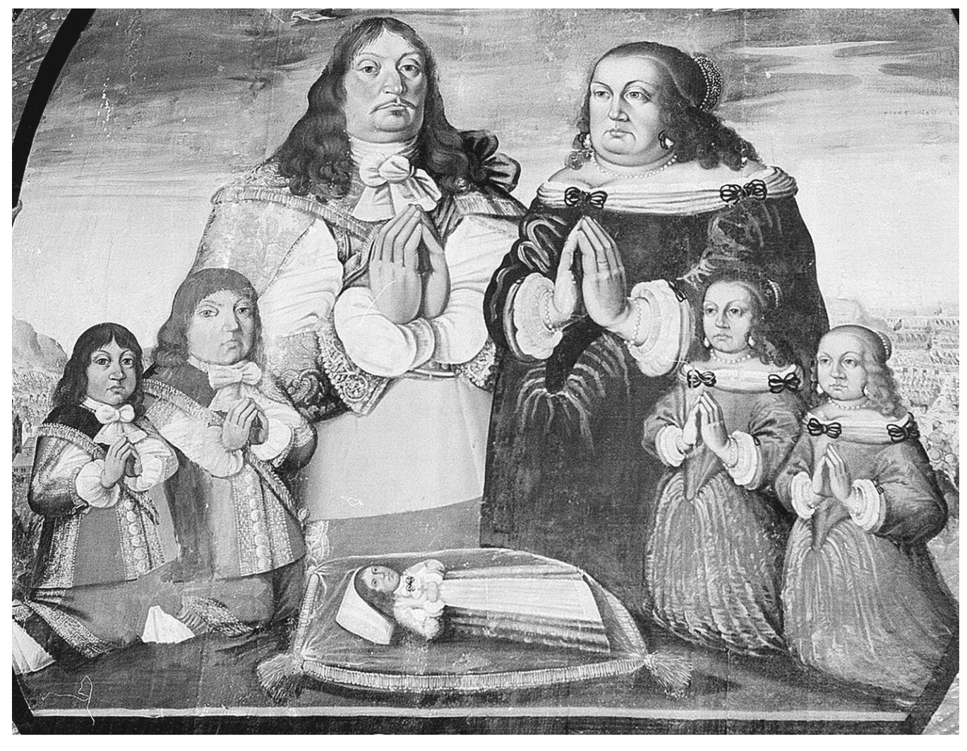
Figure 1.1 Until the eighteenth century, children were considered to be small adults (sort of "miniature grown,ups") as shown in this painting from a medieval church. Note the similarity of the facial features of the adults and the children.

In this book, we adopt the United Nations (UN) Convention definition of a child as "every human being below the age of 18 years unless, under the law applicable to the child, majority is attained earlier" [2]. That children are different from adults has not always been recognized. Previously, children were depicted as "small adults" (Figure 1.1), but recent research reflect that health services for children need to consider that children are growing and developing individuals who are dependent on an adult caregiver. This requires oral health professionals with special competencies, so, called child competency (Box 1.1).