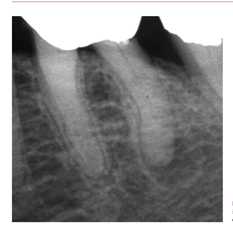
Fig. 2.2 Chronic apical periodontitis: incipient at mesial root, established at distal root of mandibular left first molar.

dominate as sources for acute dental pain in children and adults (Zeng et al. 1994; Lygidakis et al. 1998; Tulip and Palmer 2008). This may be debilitating to the patient and lead to absence from work and involvement of costly health services. While it is known that emergency dental services are in great demand in most countries, in urban as well as rural areas, there is scant information on the actual incidence and prevalence of acute pulpal and apical periodontal disease. Therefore, one can only speculate that there is still, even in communities with well-developed dental services, a significant impact on the general well-being by acute pulpal and periodontal conditions (Sindet-Pedersen et al. 1985; Richardson 2005; Cope et al. 2014).